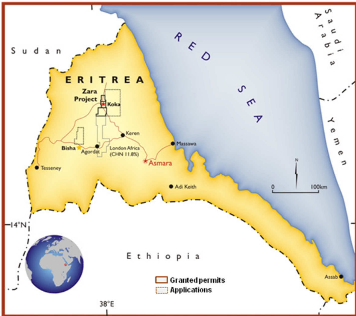
Figure 1 – Zara Project Location Map