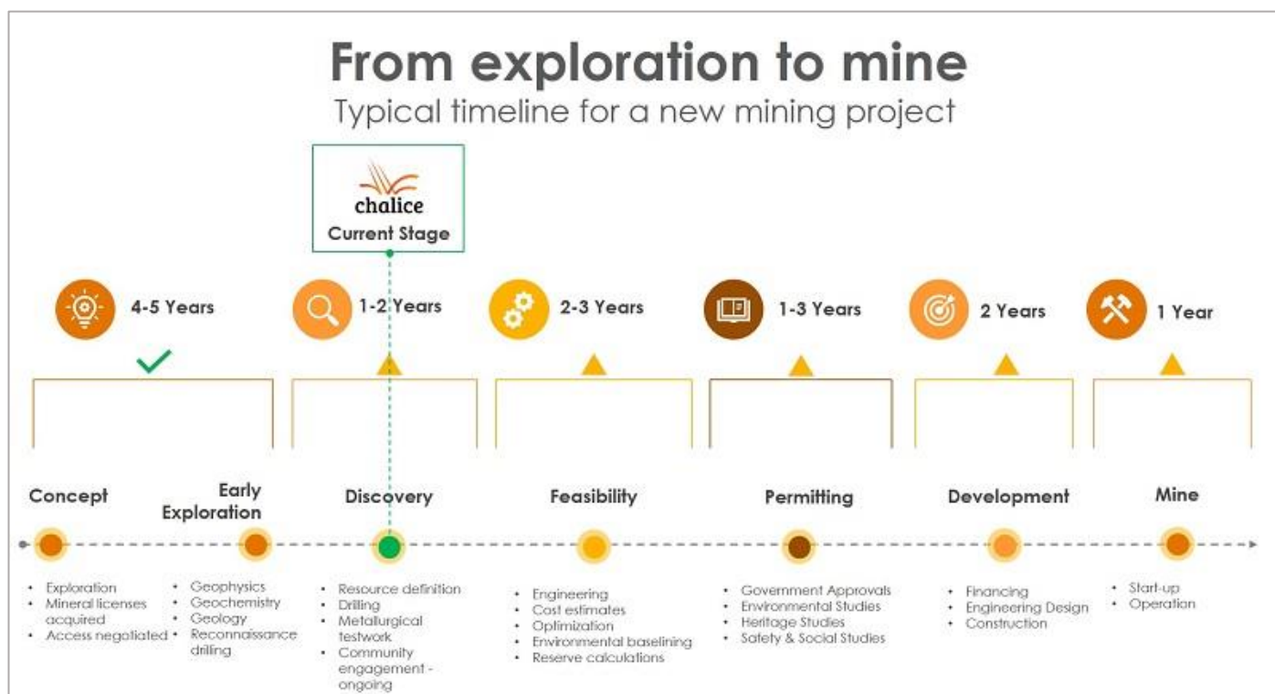
Figure 2: Typical timeline for a mining project with several stages of progression.

It is important to note that there are a number of future stages to complete before mining can commence at Julimar, and Chalice anticipates this would take several years.